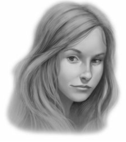
Red, Daughter of Keethro and Kilandra