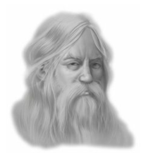
You can remember the words, but can you comprehend them?

There are secrets hidden between these pages. Truths that are hinted at, but never quite revealed. Most will skim past, never being the wiser. Some, however, may take note. They may ponder, and speculate. To those few, this is your challenge: