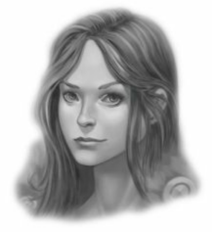
Kilandra, Wife to Keethro