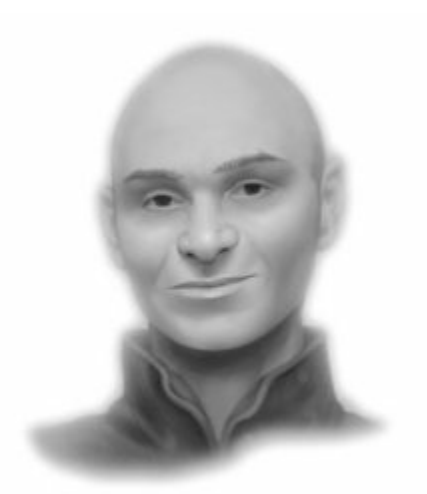
Cassen, Dutchess of Eastport