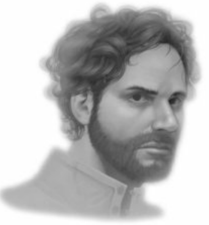
Alther of House Redrivers, Husband to Crella

Lyell of House Redrivers, Father to Alther