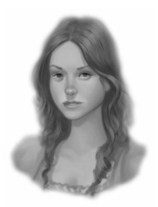
Annora of the Spicelands